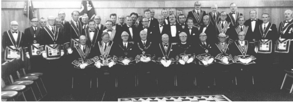
Park Hall Lodge No.8375 Consecration 25 th October 1971