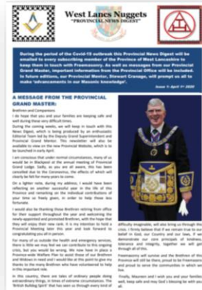
The front page of issue 1