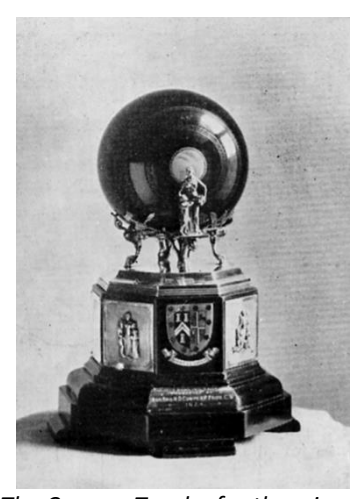
The Cowper Trophy for the winner