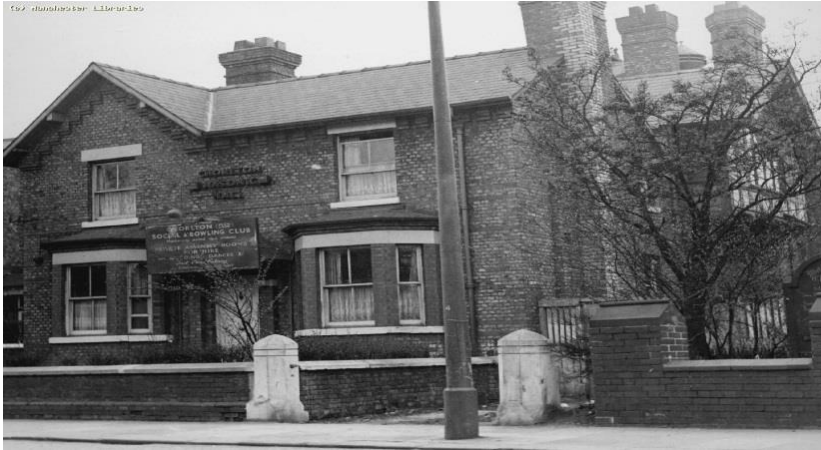
Masonic Hall, High Lane, Chorlton-cum-Hardy, 1959.

At the meeting of 9 th May 1930 a letter from the secretary of the Hands and Heart Lodge No. 4109 was read in open Lodge. The letter was an invitation to all Lodges in the South Eastern Group to co-operate in a scheme to build a new Freemasons Hall at Edge Lane, Chorlton-cum-hardy.