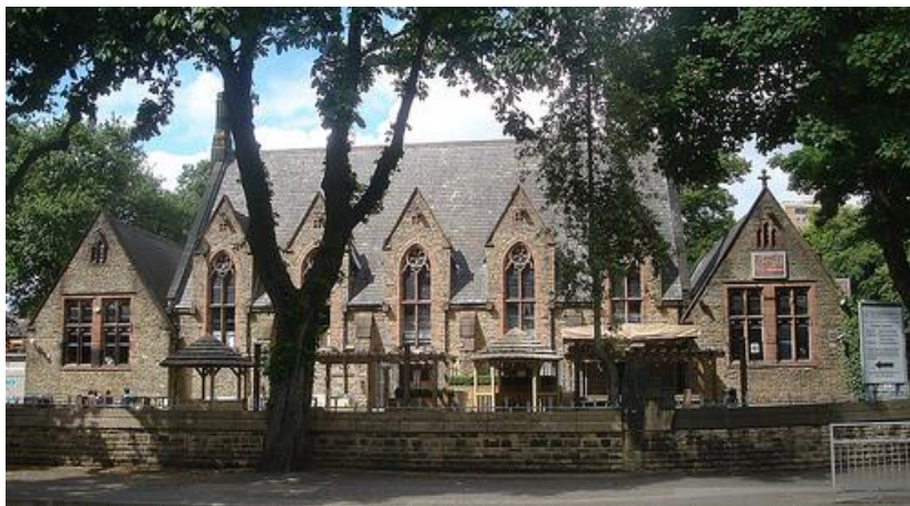
Holy Innocents Church School

The first meeting place of the Lodge was at the Holy Innocents Church School, shown below, at the corner of Wilmslow Road and Wilbraham Road in Fallowfield.