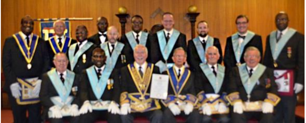
Members of Fallowfield Lodge No. 3693