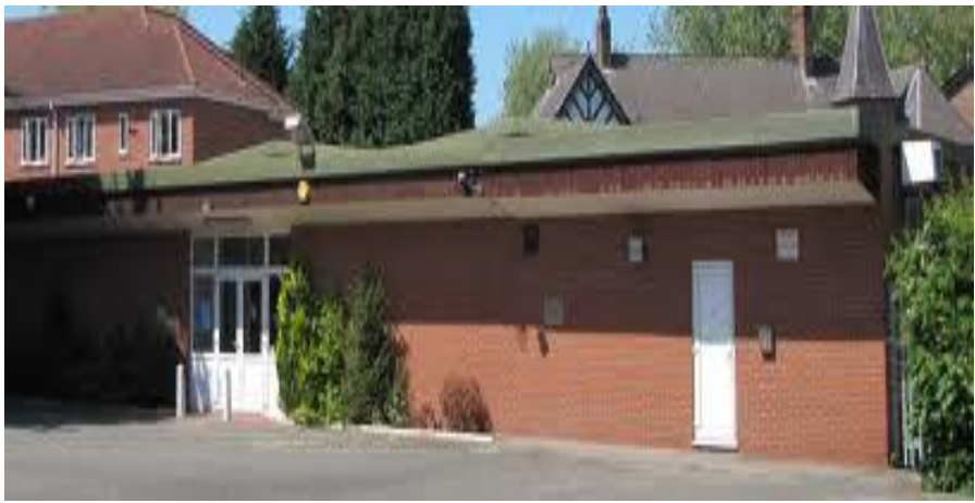
The Masonic Hall, Urmston

The Lodge spent many happy years meeting at Edge Lane and many brethren still reminisce on the several notable installation meetings, ladies evenings and other social functions held at the hall over the years. However, due to the high cost of maintaining the building, the management committee and shareholder Lodges made the painful decision to sell the building. In 2005, the South Manchester Masonic Hall was sold to developers and the Lodge moved to its present home in Urmston.