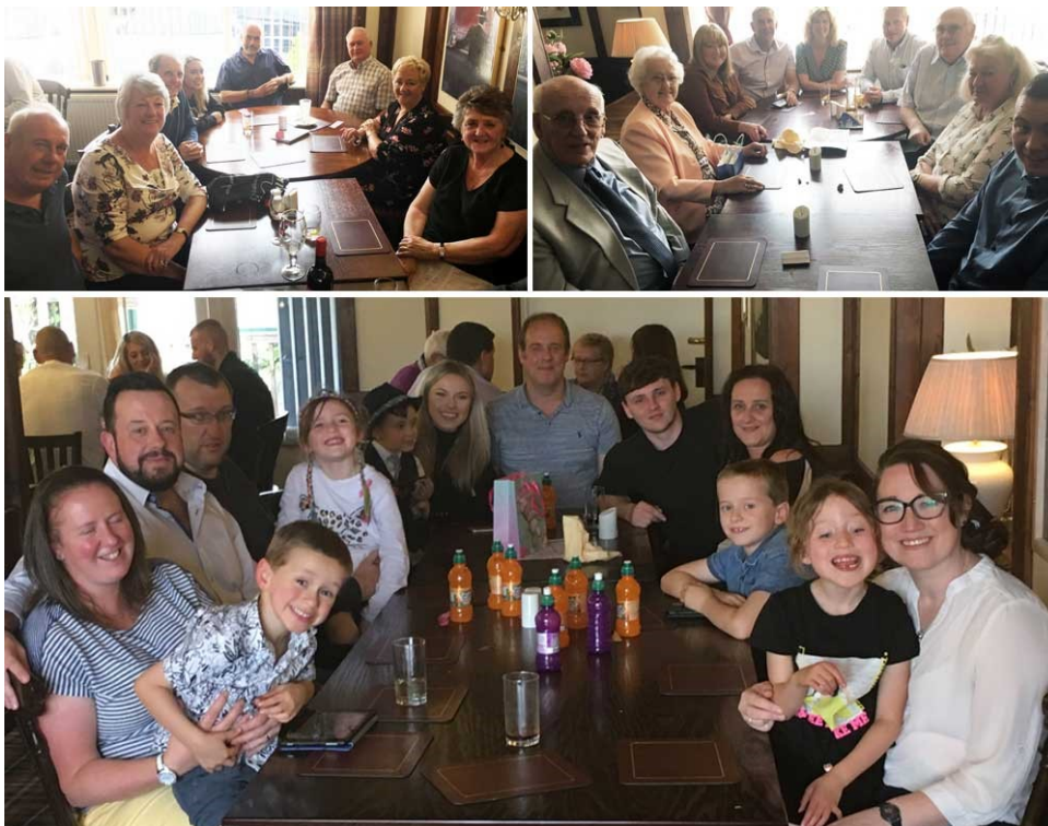
The brethren, wives, partners and children who attended the Sunday lunch.

Everyone who attended the lunch enjoyed great food and more importantly the company. All are looking forward to the next social event. During the course of the afternoon a raffle was held which raised £95 for the social fund which is used to make donations to local non Masonic organisations and clubs.