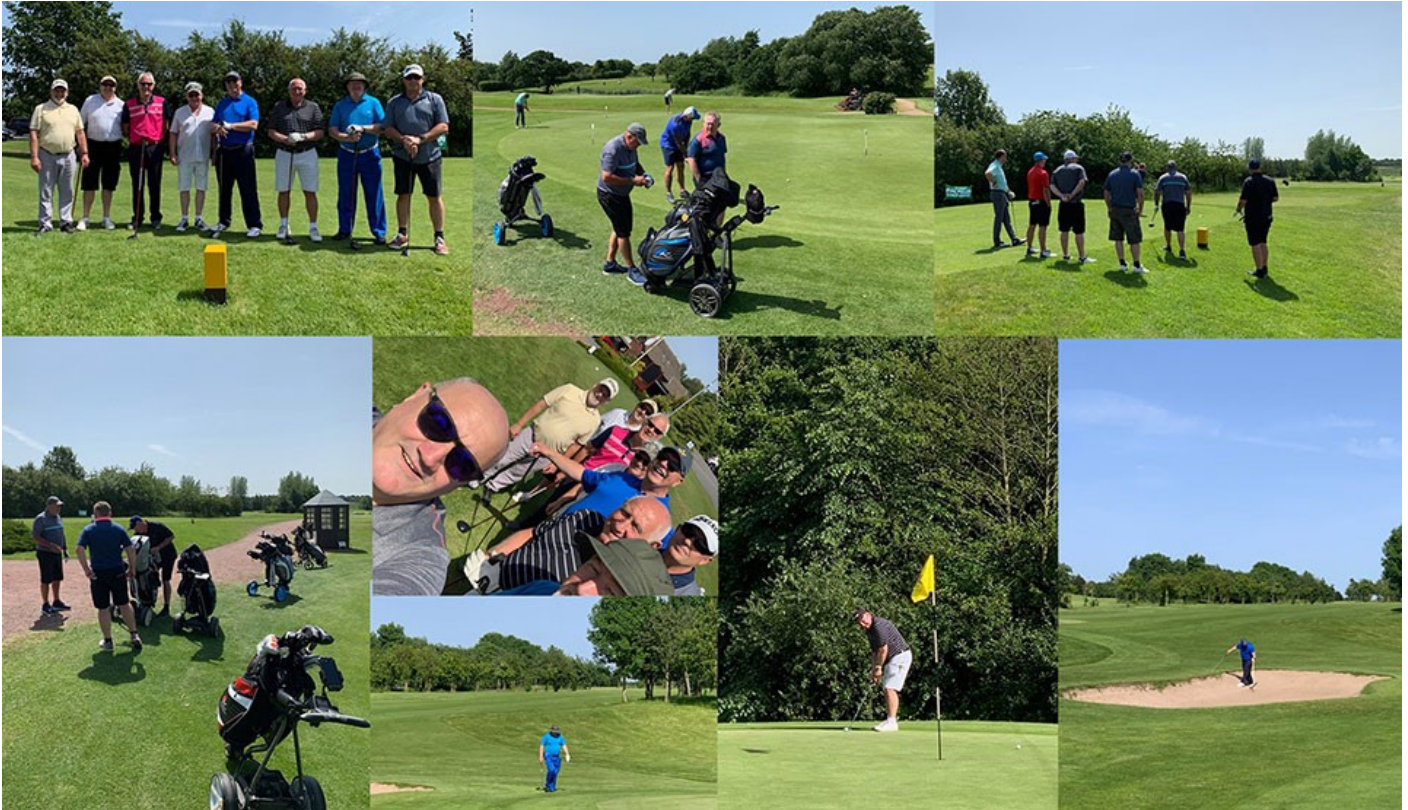
Highlights from the day.