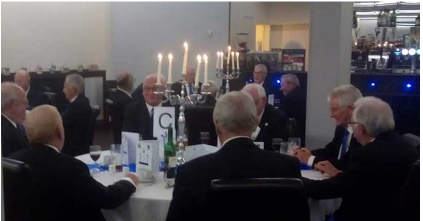
The brethren enjoying the festive board.