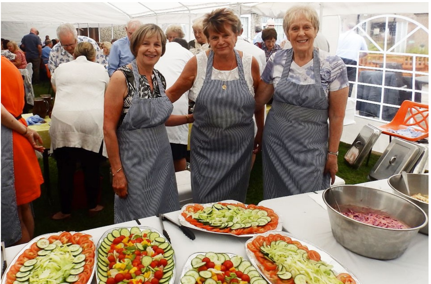
Serving the 'meat feast'