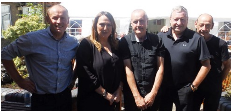
The ‘Whisky Wooders’.