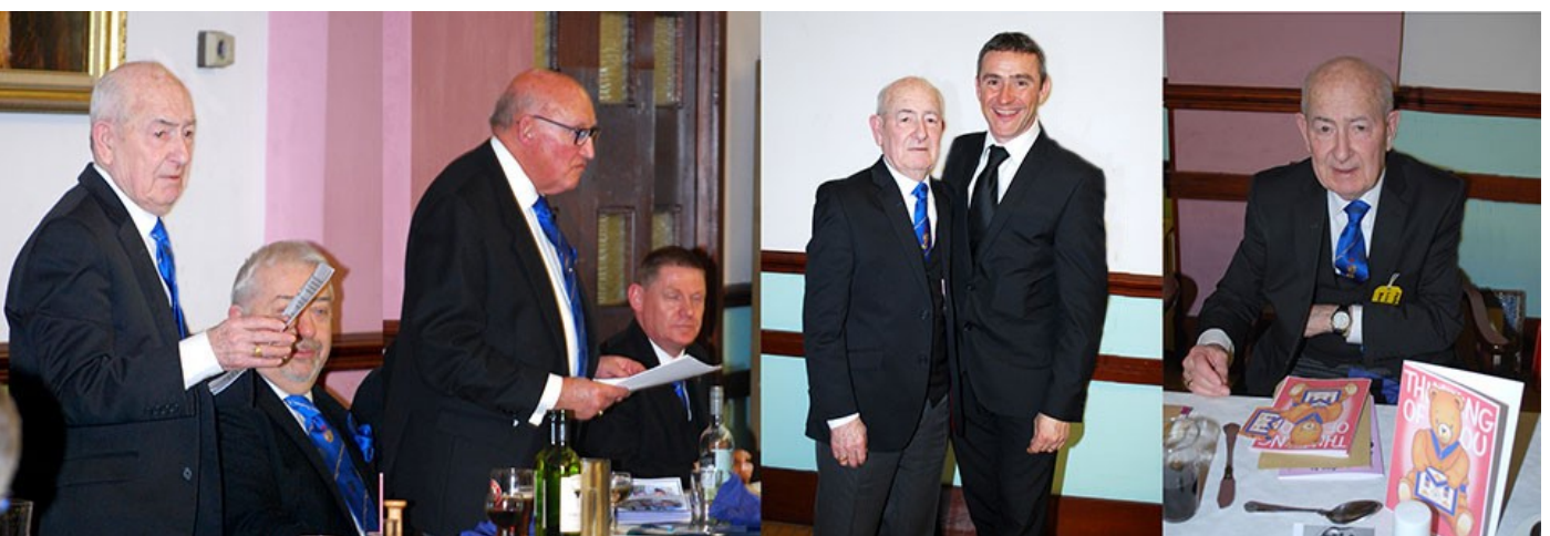
Highlights from the festive board.