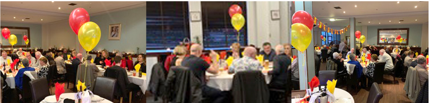
Highlights from the Tapas Night.