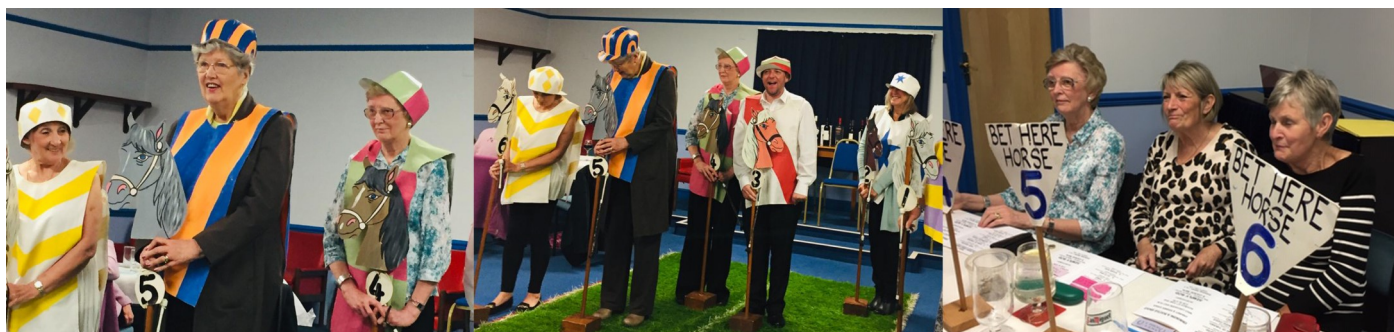
Highlights from the Race Night.

The night was another great success for FROTH with everyone enjoying themselves, with lots of humour amongst friends.