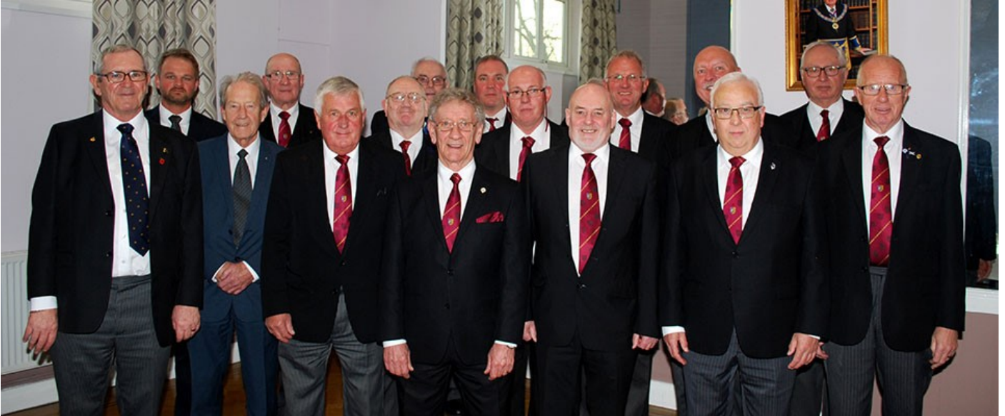
The demonstration team

Following the convocation, the companions and guests retired to the festive board, with the whole evening being an enjoyable and great success for the group, and for Unity and Perseverance Chapter who hosted the evening.