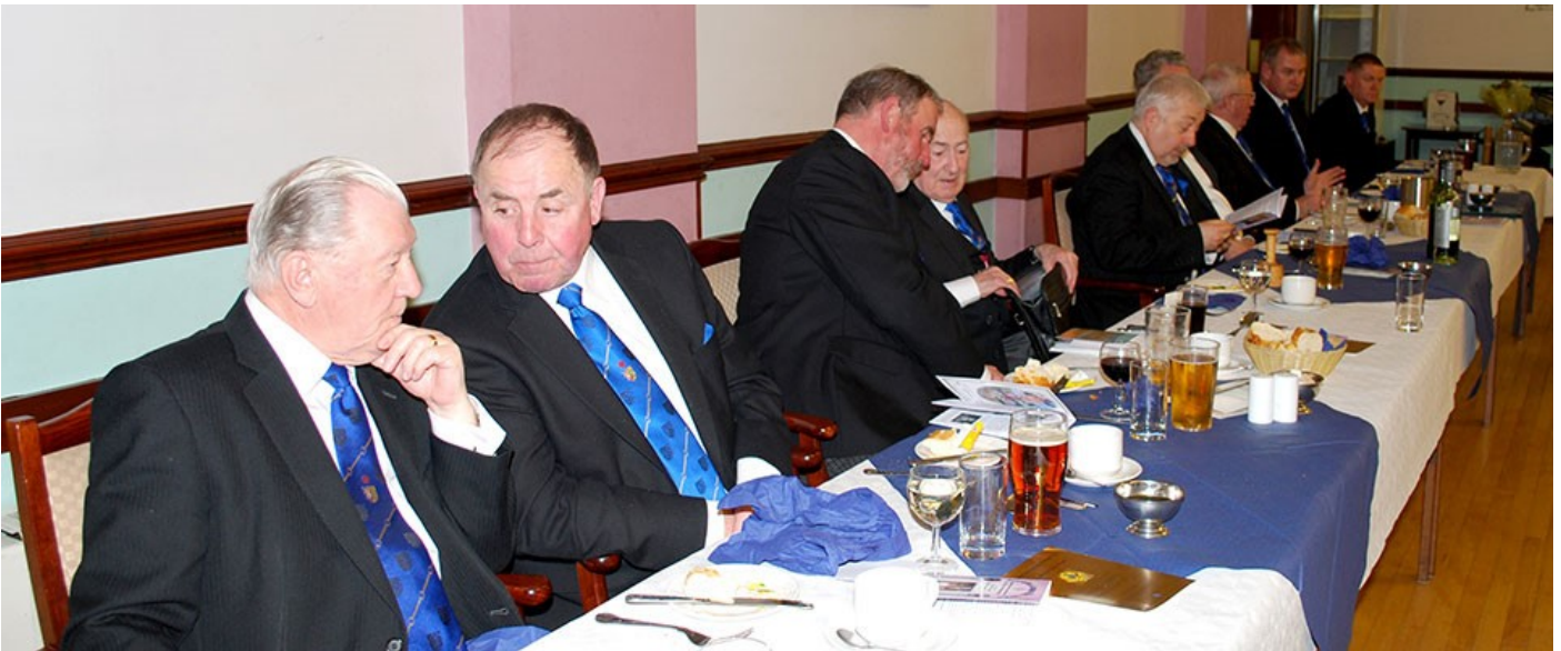
The top table