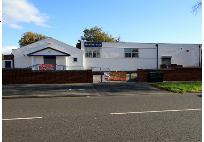
The Litherland Masonic Hall

The sandstone that had been removed from the wall has now been incorporated into a rockery that has been started by Tom Croll who has also supplied plants and shrubs from his garden. The wall to the side of the emergency escape from the Dining Room has also been repaired.