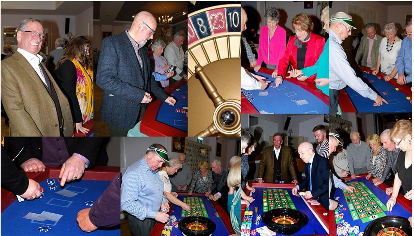
Highlights from the Casino night.