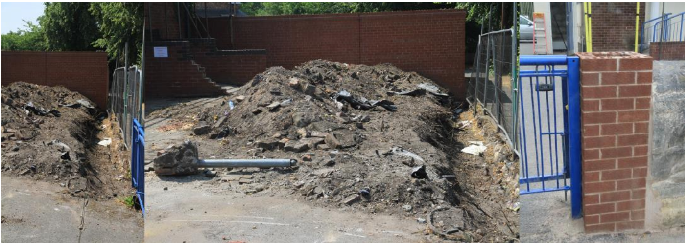
The rebuilding of the front walls

Whilst all this was in progress, the front of the building was scaffolded and repair work commenced on the fascia of the building and the copings. On the completion of the repairs, the fascia was "K" rendered (I'm told, whatever that may be!) The railings fixed to the building frontage, were removed, powder coated and refitted.