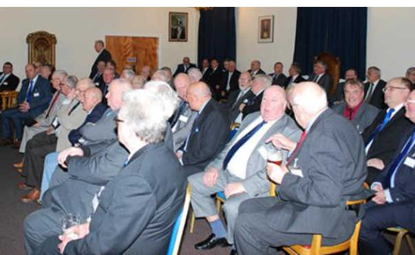
The audience during the question and answer session.

With the question and answers session being completed everyone made their way to the dining room, where an excellent dinner was served starting with a black pudding stack, followed by roast beef, with Yorkshire pudding and seasonal vegetables and for dessert, profiteroles with chocolate sauce and pouring cream, which was shortly followed by tea or coffee and mints.