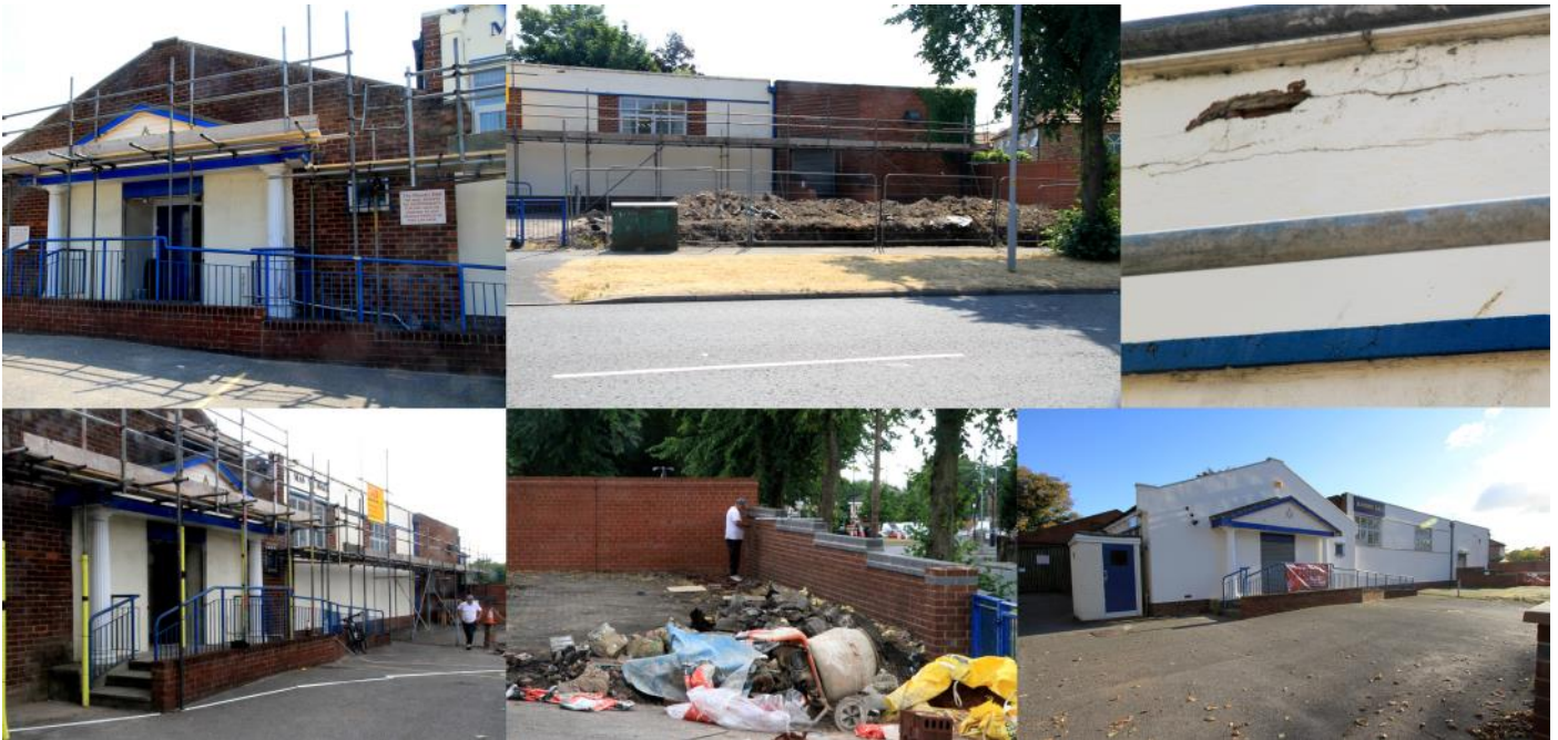
The building work being carried out on the exterior of the building and the hall once rendered and painted