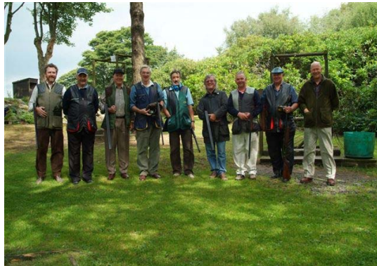
Some of the Members at Kelbrook

Kelbrook Lodge is situated in woodlands 400m up the track to the left hand side.